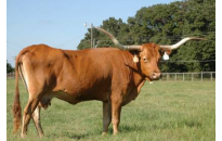
LAMB'S POWER PLAY